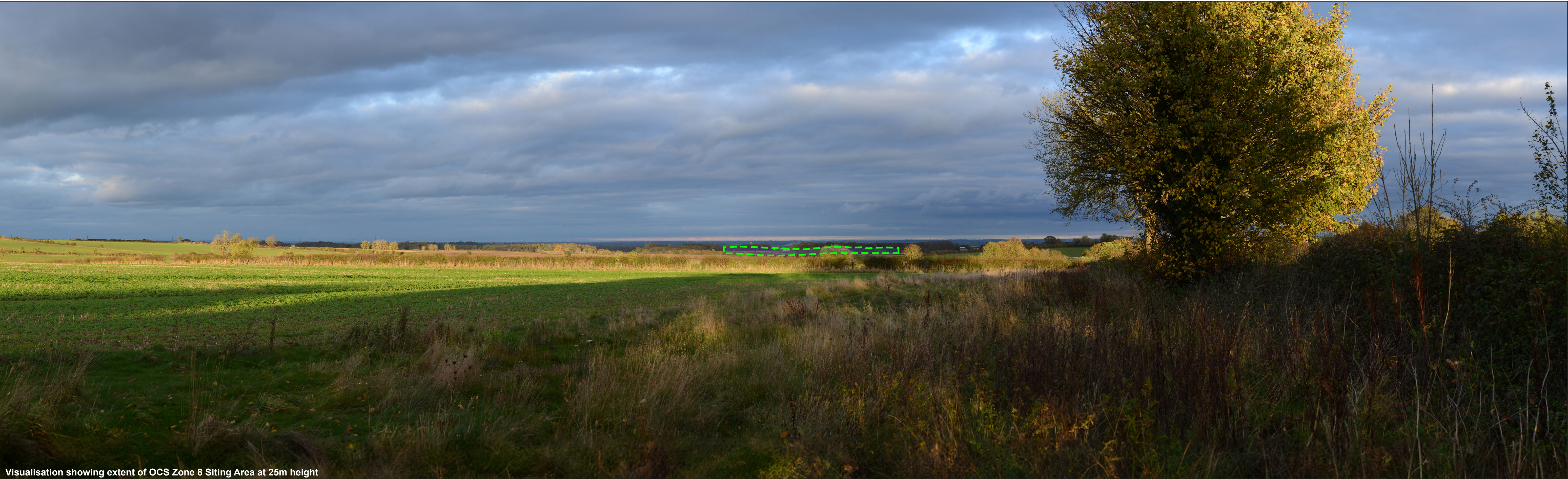
Visualisation showing extent of OCS Zone 8 Siting Area at 25m height